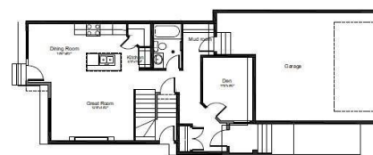
Main Floor Plan 824 sq. ft.

▶ 26' Pocket Two Story ▶ Legal Basement Suite (optional) ▶ (1 or 2 bedroom options available)